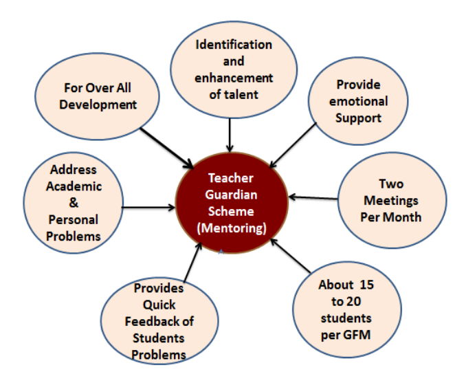
Figure 1: Activities under Faculty as Mentor

• The group of 15-20 students is allotted to each Faculty for mentoring. This ensures one to one interaction and helps Faculty to know their strengths and weaknesses. Faculty Members are selected by respective Departments.